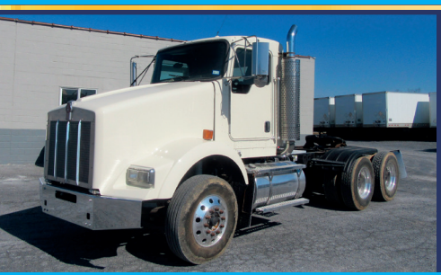
Kenworth T800 T/A