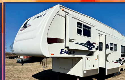
Jayco Eagle, (4) Slide Outs- Nice